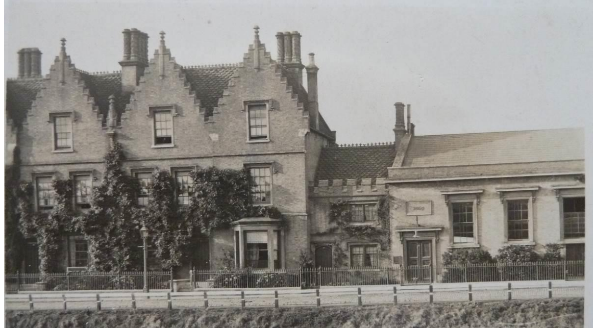
Figure 2: 22–24 North Brink and the meeting house (right) in an undated photograph

In 1971–72, four flats for single elderly people and one warden's flat were created on the upper floors of the meeting house in co-operation with the East Anglia Housing Association (architect: Cecil J. Bourne of Cambridge); a proposal that had been planned since the mid-1960s. At the same time, the smaller of the two originally separate meeting rooms (the former women's meeting room) became a dining room (photo bottom left, p. 1) and the sash shutters between the two rooms were replaced by a brick wall. An attic was added above the meeting room with three dormer windows to the street, and a new floor was added above the new dining room (formerly full height like the main meeting room). A three-storey rear extension was built over part of the burial ground, replacing a small single-storey extension, containing toilets and a kitchen on the ground floor and flats on the two upper floors. The rear elevation was rebuilt (photo top right, p. 1), replacing the high-level sash windows to the former women's meeting room with French doors and casements to the ground and first floors. A lift was inserted. The larger warden's flat was on the first floor, above the former women's meeting room. Later the four flats were reduced to three of equal size.