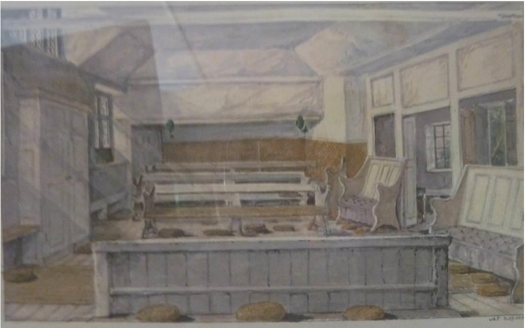
Figure 1: Watercolour by Algernon Peckover of the previous meeting house in 1853 (Wisbech Meeting House)

From 1711 two thatched cottages were adapted as meeting house (not apparently a purposebuilt structure as described by Butler) (figure 1). John Hancock (died 1737) and his daughter (died 1746) were buried below the elders' bench in the meeting house. (According to tradition, the burials are still there, although this seems unlikely given the later rebuilding.)